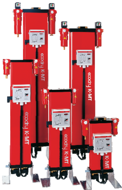
Desiccant Air Dryers