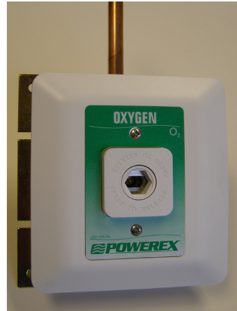
Part Number PX-DCN91XP1124 shown

The outlet nameplate shall be permanently color coded with a durable, scratch resistant and protective label. The outlet trim plate shall be die cast aluminum, powder coated white, attached with the nameplate to the rough-in assembly, and provide automatic plaster adjustment from ½ to 1 ¼ of an inch (1.3 cm to 3 cm). The name of the gas service shall be permanently marked on the outlet bracket and the outlet. The outlet's rough-in supply tube shall be