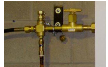
20" Header Length

Primary (left bank), Secondary (right bank), and Emergency Reserve bank