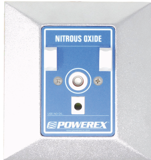
Part Number PX-ASN91XA1104 shown

Medical gas outlets shall be cleaned for oxygen service in