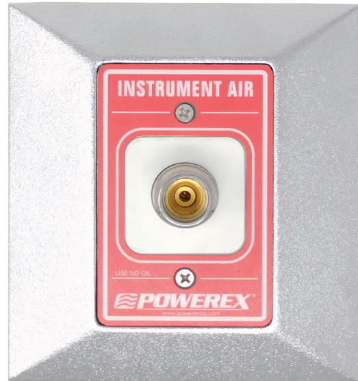
Part Number PX-ASN91XF112080 shown

The medical gas outlets shall be designed so that, once installed, routine service of both the primary and secondary check valves can be accomplished without removing the nameplate or gas specific portions. The primary check valve shall be unitized and of the cartridge type. So that the primary check valve can be removed for service without shutting off the gas supply to the outlet, the secondary check valve shall operate automatically to stop the free flow of the positive pressure gas services. There shall be no secondary check for vacuum or WAGD services. Medical gas outlets which require the removal of the nameplate or gas specific components for routine service shall not be acceptable. The seal between the