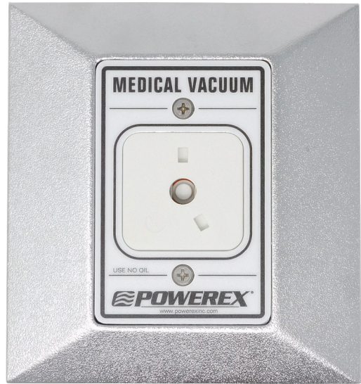
Part Number PX-ASN91XQ1122 shown

Medical gas outlets shall be cleaned for oxygen service in accordance with the current Compressed Gas Association